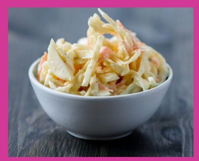
Sweet & Tangy Coleslaw

Visit CHELCO.com/recipes to learn this recipe!