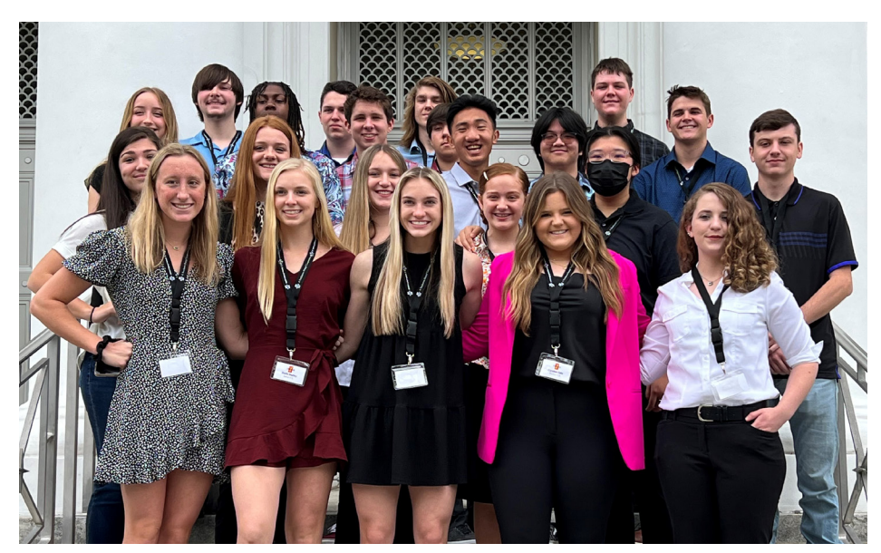
Students from local high schools visited Tallahassee for the Florida Electric Cooperatives Association Youth Tour, the first one held since 2020.

In February, 22 students from local high schools visited Tallahassee for CHELCO's Youth Tour program, hosted by the Florida Electric Cooperatives Association (FECA).