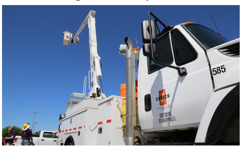
CHELCO offers bucket truck rides for kids at the Annual Meeting each year.

CHELCO's in-person Annual Meeting is back! After a two-year pause due to the COVID-19 pandemic, we'll be hosting our first in-person meeting since 2019 on April 9 at Freeport High School.